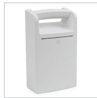
LIFEKINNEX™ POWER SYSTEM

Additional accessories available at healthcare.ergotron.com .