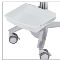
SV FRONT TRAY