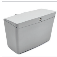
SV STORAGE BIN