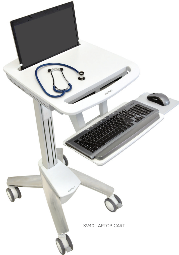
SV40 LAPTOP CART