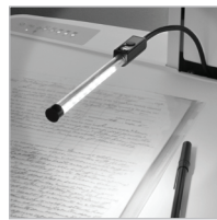
SV TASK LIGHT