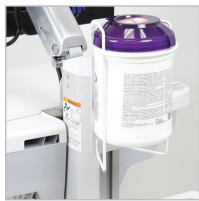
SV SANI-WIPES HOLDER