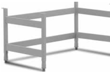
Manually adjustable stand enables cabinet to be set at a comfortable working position between 750-950mm