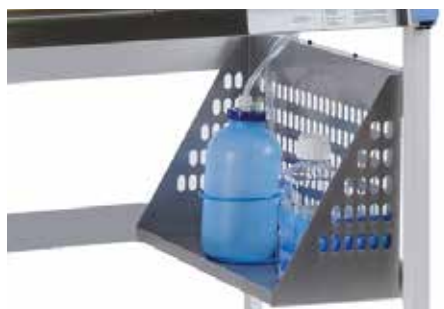
SmartPort floor stand hanging shelf to keep area beneath cabinet clear to ensure adequate legroom for a comfortable working position