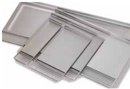
Configurable work surface improves flexibility of the working area