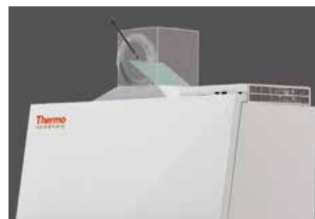
Direct duct exhaust can be added when working with trace amounts of volatile chemicals