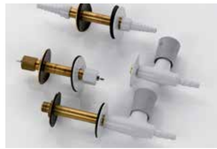
Side wall service taps are easy to install