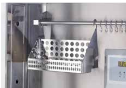
Utility basket with hanging bar increases flexibility of the working area and helps improve organisation