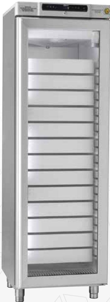
BioCompact II RR410. Drawers, glass door and reference container are optional extras.

The BioCompact II 410 is a large refrigerator or freezer cabinet with a small footprint, designed for a wide range of biostorage purposes where the prime focus is on dependability and exceptional performance.