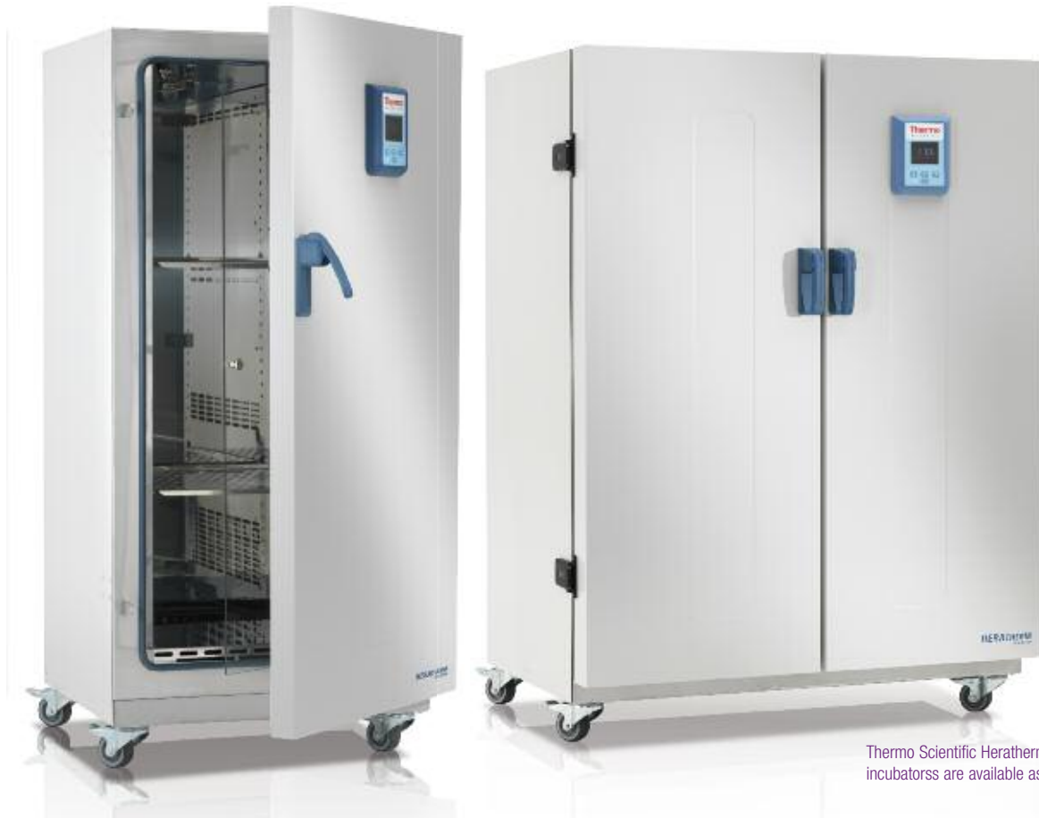
Thermo Scientific Heratherm large capacity incubators are available as 400 L and 750 L units.

Designed with your need for high sample volume or larger samples in mind.