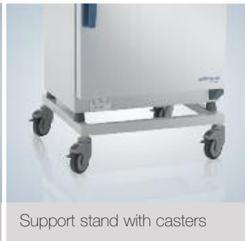
Support stand with casters