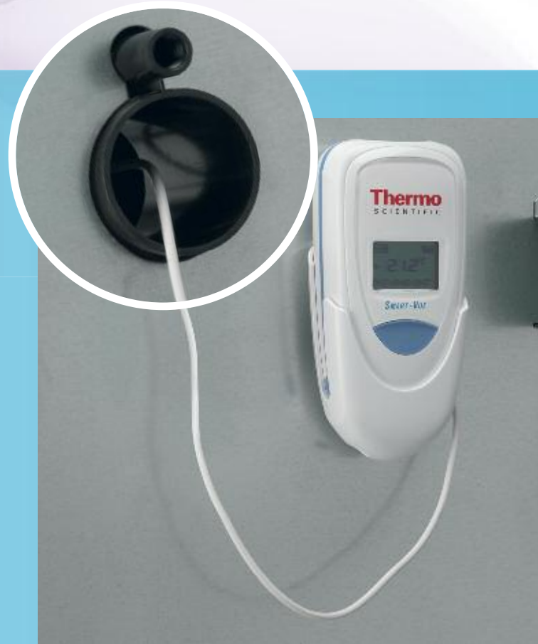
Rear view of the 100 L Advanced Protocol oven with Smart-Vue

Solutions vary by RF regions worldwide and are compatible with multiple brands and types of laboratory equipment. Contact your local sales representative for more details.