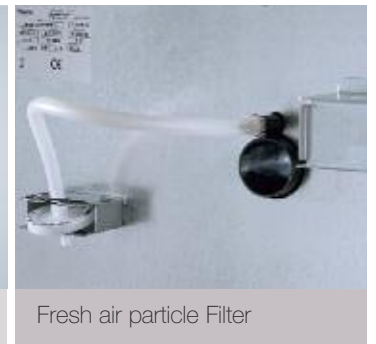
Fresh air particle Filter